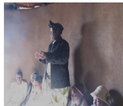
The Home-Based Care team begins their day with prayer.

"Above all, love each other deeply, because love covers over a multitude of sins. Offer hospitality to one another without grumbling. Each of you should use whatever gift you have received to serve others ..."