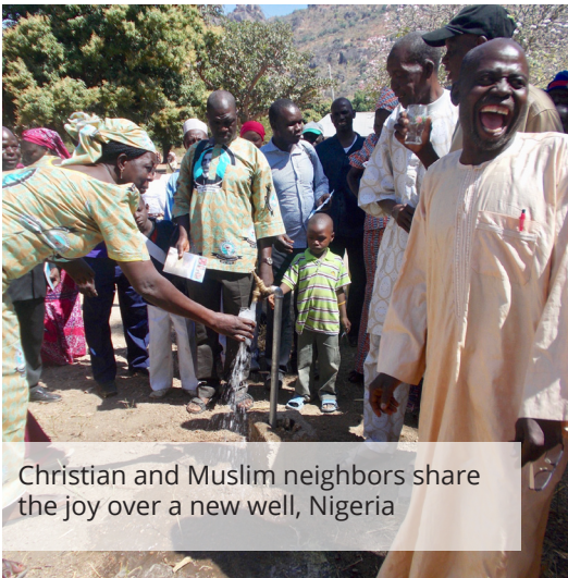
Christian and Muslim neighbors share the joy over a new well, Nigeria

In northeastern Nigeria the presence of terrorist groups like Boko Haram and ISIS can escalate existing tension between Christian and Muslim neighbors. On my last visit to Nigeria, a young Christian boy had just been killed by Boko Haram in a village where GHM has partnered for a decade to empower volunteer health workers. In many villages, Christians would retaliate against Muslims after such an event. But in this case, the family of the boy carried his body to the center of the village, saying to everyone, "This was not done by our neighbors! This was done by foreigners! Leave our neighbors in peace!" Ordinary people, united through a decade of improving each other's lives through better access to health, were now a force for peace.