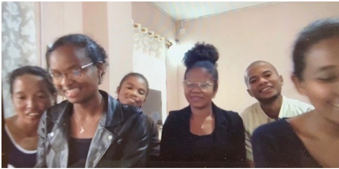
SEFAM's first cohort of Community Health Nurses

Madagascar is anything but ordinary. A biodiversity hot-spot, 90% of its plants and animals are found nowhere else on the planet; it is the world's leading exporter of vanilla; and it is the 4th largest island in the world – over three times the size of Great Britain. But it is also among the poorest of countries, with nearly 3 out of 4 people living in extreme poverty (less than $2/day).