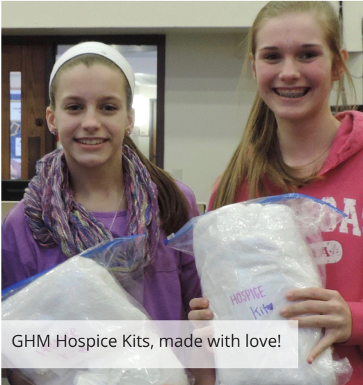
GHM Hospice Kits, made with love!